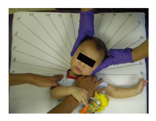
Fig. 2. Lateral cervical flexion PROM measurement.

The pediatric physical therapist who administered the intervention was blinded to results of study measures. Participants received eight sessions of physical therapy (PT) using a NM/VM approach lasting 30–50 minutes, every two weeks as tolerated by the infant. The NM/VM approach is based upon the work of Barral and associates<sup>27, 28)</sup>. With both manipulation approaches, the therapist palpated the infant's body to determine the location of the tissue restrictions. Once the restrictions were located, the therapist gently mobilized the identified tissue manually, not imposing a direct stretch on the neural, fascial, or vascular tissue, until these tissues were ready to elongate. Techniques were modified if the babies fussed, to avoid crying during the sessions. With the exception of positioning alternatives during sleep and "tummy time", the parents were not instructed in any home exercises.