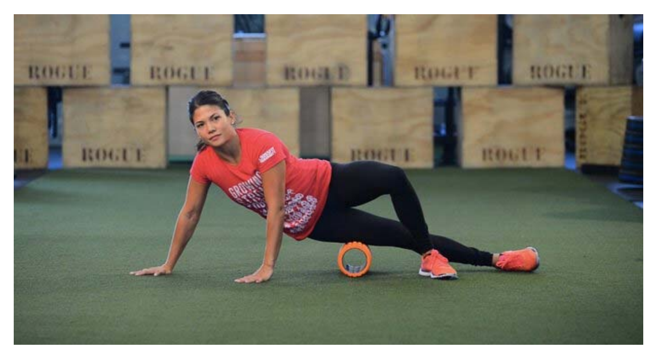
Balls and foam rollers are great for fascial release.

If we stop moving one part, or all, of the body then the fascia starts to dehydrate, solidify and constrict. This spot becomes like a dam for the energy, the information and the signals. We lose awareness in that part of the body and healthy function.