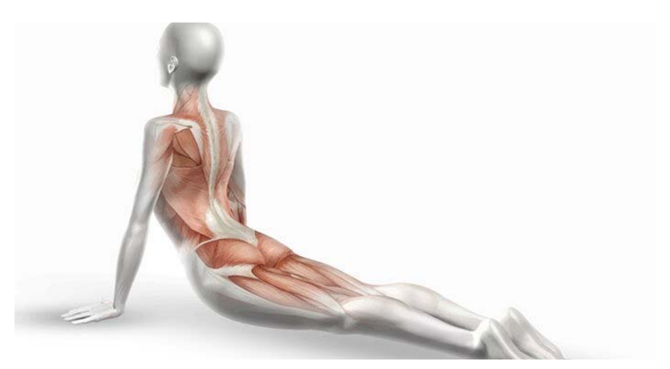
Long-held yoga poses help release tension in our muscles, fascia, and mind.

Foster tells us that impacting our fascia can affect our nervous system. She says, "Gentle pressure on your fascia may help communicate to your nervous system that there is no longer any need for increased tension in that area." And so, by influencing these deeply held tensions in one part of the body, we can start to not only unravel and release tension in other parts of the body, but also in the mind.