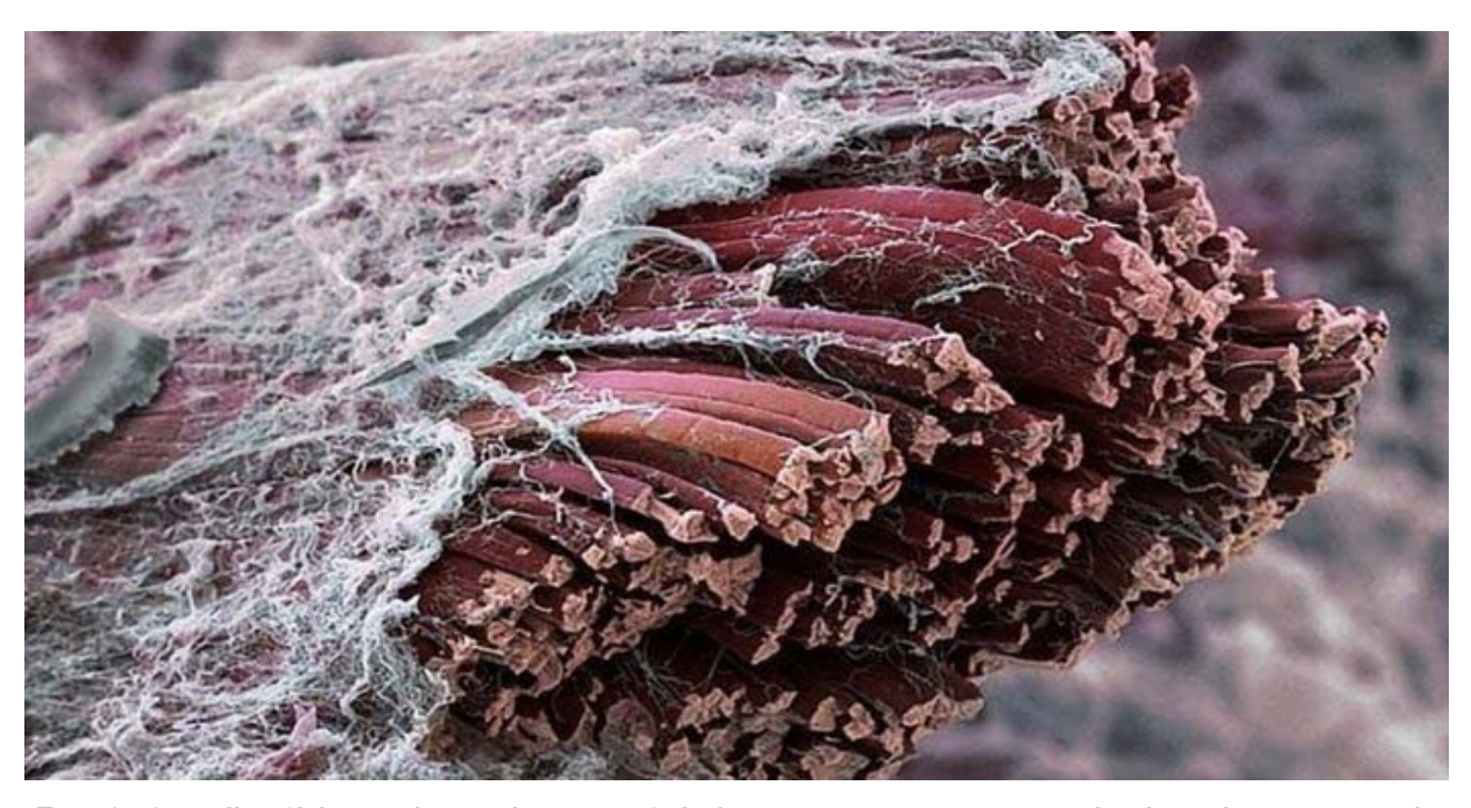
Fascia is a flexible and sturdy material that covers every muscle, bond, organ and nerve.

As the research on fascia evolves, we learn new ways of unravelling deeply held tensions in this connective tissue, which greatly impacts our mobility as we age, as well as affecting our mind. And although we yogis often hear the word fascia associated with yin yoga, Western science is continuing to discover new ways of releasing and rehydrating through different forms of movement.