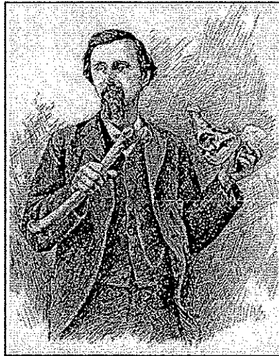
Figure 1. Andrew Taylor Still, MD, DO, first proposed the tenets of osteopathic medicine in 1874.

To drain cervical lymphatics stand on the right side of the patient, in dorsal position, place the left hand on the forehead, and with the right hand reach over the sternocleidomastoid muscle, draw the muscles up closely around the chin, with pressure on parotid and sub-mental gland, turn the head away gently with the left hand, and continue this movement downward, one vertebra at a time, to the seventh cervical. 21