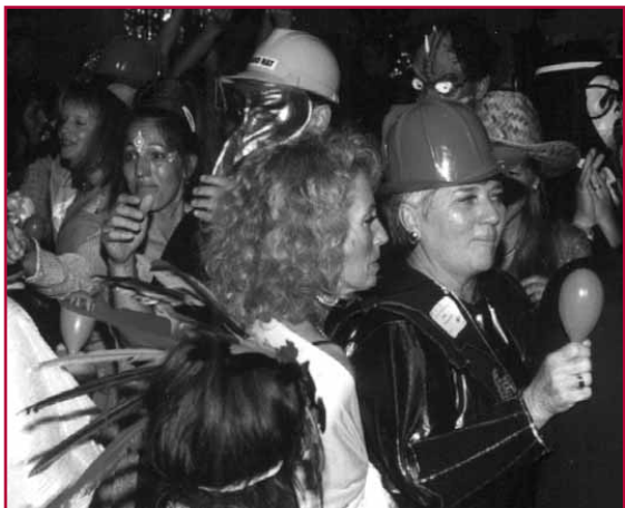
Saturday night's dinner dance brought therapists together in a fun "2001: A Mind Odyssey."