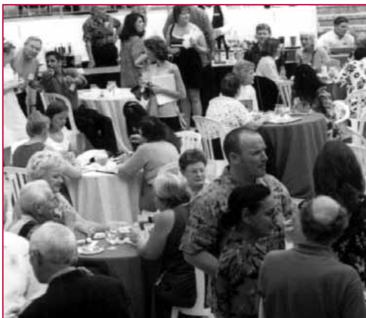
Opening night at BT'D '01. Time for mingling and catching up with colleagues from around the world.