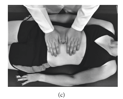
FIGURE 1: Visceral manipulation techniques for stomach (a), liver (b), and placebo technique (c).

assess pain intensity (11-point scale; 0: no pain, 10: the worst possible pain imaginable) [21, 24]. Pain area was documented on a body chart. The drawings were subsequently digitized and pain areas were measured using open-source software ImageJ (Version 1.43, National Institutes of Health, Bethesda, Maryland). The reproducibility of the measurements has been verified in a previous study and was considered acceptable as a pain measurement tool in clinical practice and research [25].