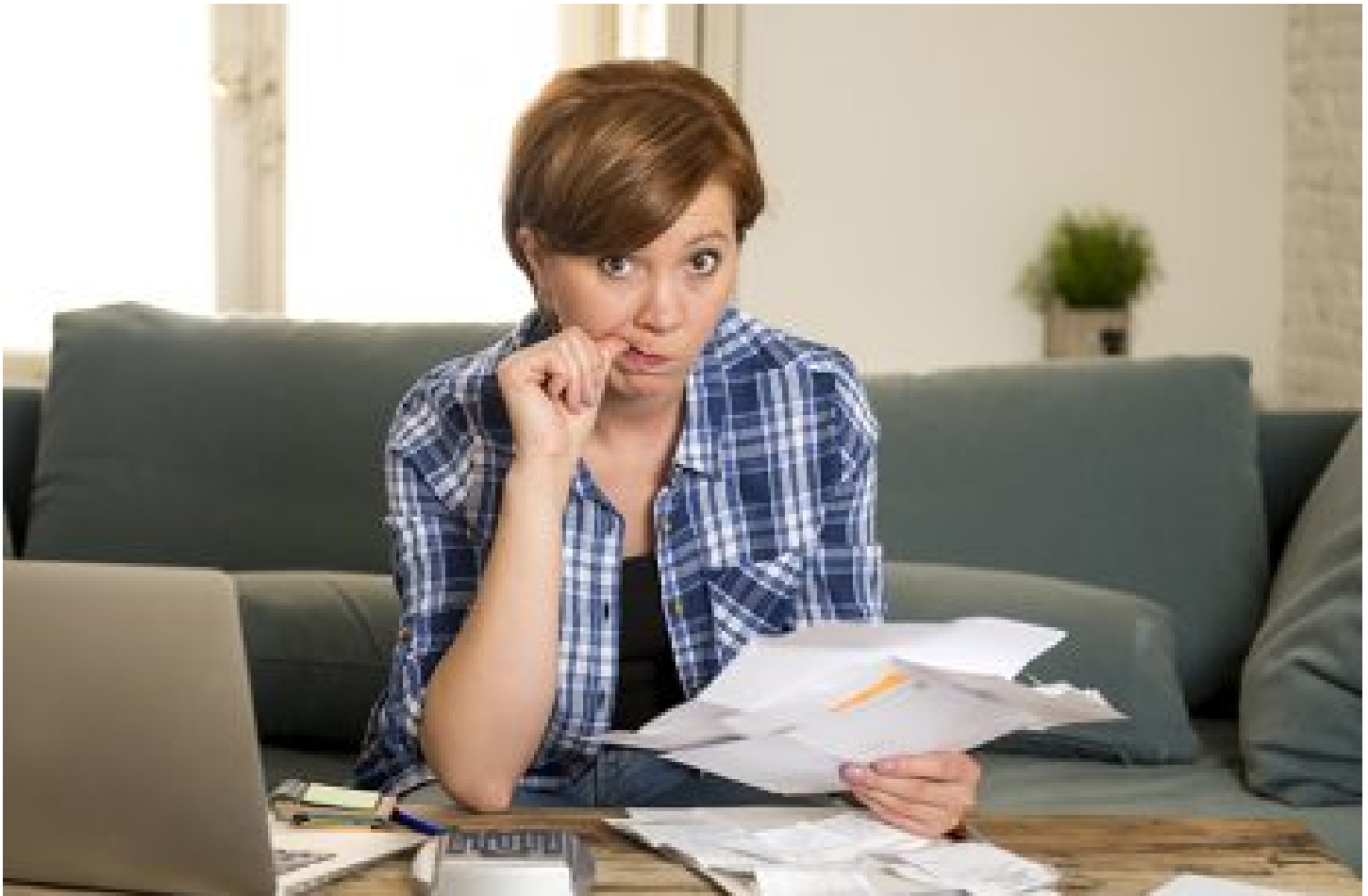
( https://www.massagemag.com/how-to-handle-financial-stress-88399/ )