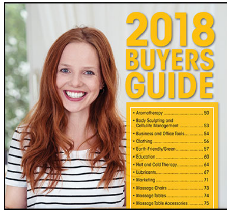
( https://cdn.massagemag.com/wordpress/wp-content/uploads/2018-Buyers-Guide.pdf )