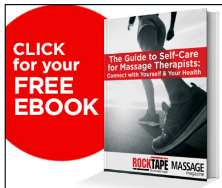
( https://www.massagemag.com/rocktape-ebook/ )